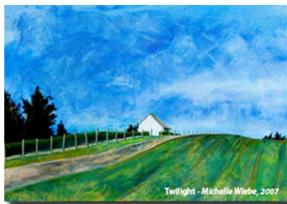
Canadian Cochrane Symposium Edmonton, Alberta: March 6-7, 2008