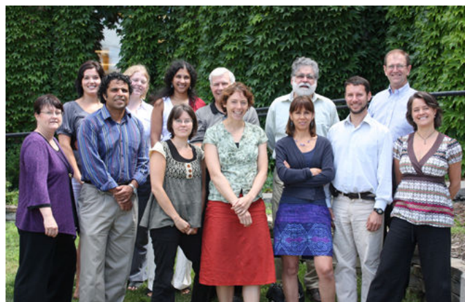
CCIRH Steering Committee meeting, July 2008 www.ccirh.uottawa.ca