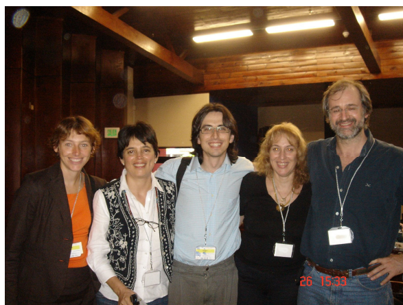
Cochrane Iberoamerican Network meeting, June 2008

June, 2008—The Canadian Public Health Association Conference. The theme of this year's conference was "Public Health in Canada: Reducing Health Inequalities through Evidence &