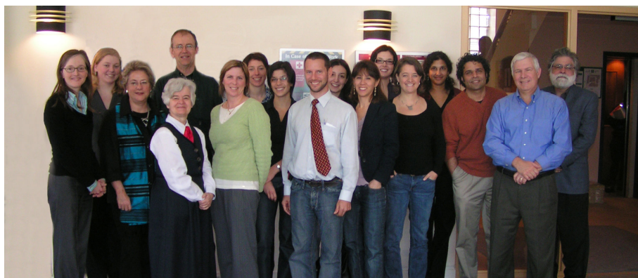
CCIHR Steering Committee meeting, March 2008

A consensus meeting of 22 experts in immigrant and refugee health (clinicians, epidemiologists, public health and immigrant community representatives) developed a systematic 14 step process to identify, synthesize and evaluate the literature. A standardized search strategy was used and the quality of identified studies assessed with validated tools.