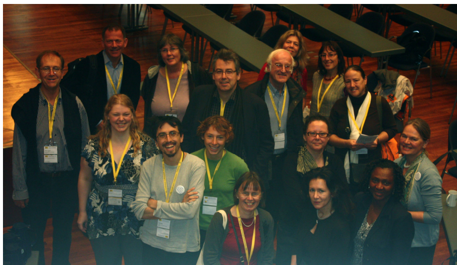
Participants at the Open Equity Meeting, October 2008