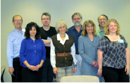
- CDC and Equity Team