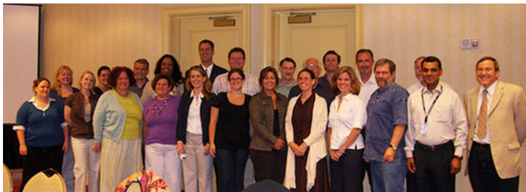
- CJHF Exploratory Meeting in Orlando, Florida.