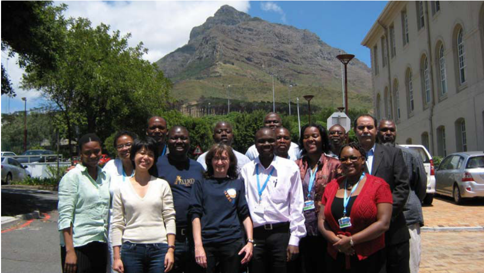
- Equity Watch Methods Workshop Delegates