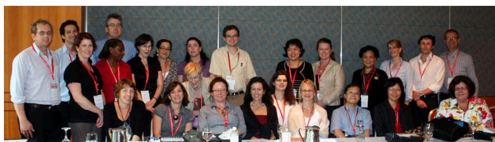
Open Equity Meeting at the 17th Cochrane Colloquium in Singapore: thank you to our colleagues and collaborators for your support!